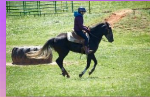
Casey Hiser Extreme Cowboy Races