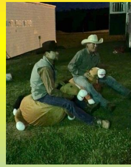
Pro Division Race!!!