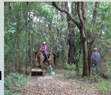
Novice Gaited Sport Horse