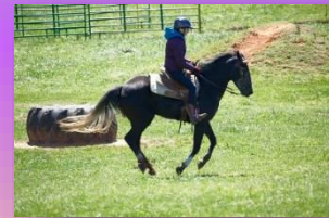
Casey Hiser Extreme Cowboy Races