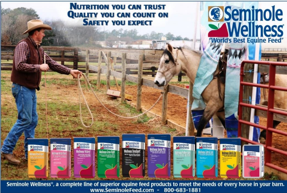
Seminole Wellness®, a complete line of superior equine feed products to meet the needs of every horse in your barn. www.SeminoleFeed.com - 800-683-1881