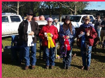
First Year Amateur