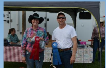
Green Horse Division