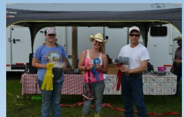
Non Pro Division