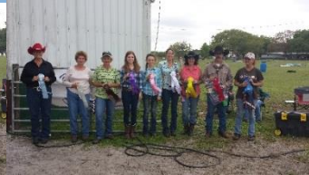
Timed Obstacle Challenge