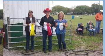
Novice Gaited Sport Horse