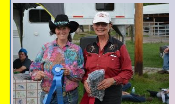
Ride Smart Division